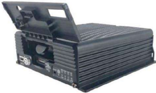
Front Panel – HDD /SD Storage